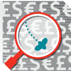
Costs and duties imposed by incident investigations