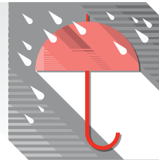
Increased liability insurance premiums