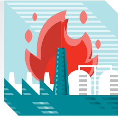
Plant closure due to large-scale events such as fire