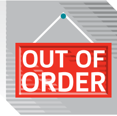
Equipment damage and process downtime