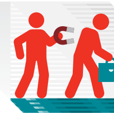
Recruitment and retention challenges