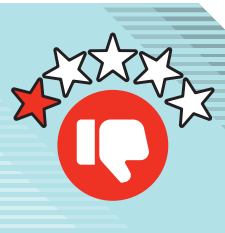
Damage to reputation and good-standing